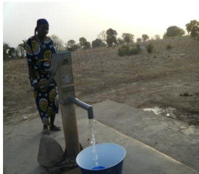
Photo 1: Borehole equipped with a manual pump in the Kokey district

These are boreholes equipped with a submerged pump and a manual or foot-operated pumping system. The boreholes are four hundred and fifty-one (451) of which three hundred and ninety-eight (388) are functional. distributed in the ten districts of the Municipality of Banikoara and mainly supply the populations. Two models of boreholes equipped with Human Motricity Pumps (FPM) are installed. These are foot pumps and hand pumps (Photo 11 and 2).