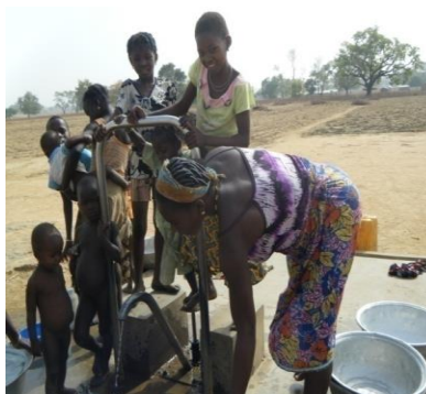
Photo 2: Borehole equipped with a foot pump in the district of Ounet