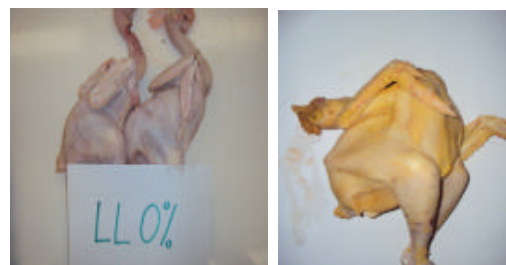
Fig. 3: Normal color (left picture) and intense yellow color (right picture) of skin of carcasses from growing indigenous Senegal chickens fed diets containing respectively 0% (LL 0 ) and 21% (LL 21 ) of Leuceana leucocephala leaves meal

This increasing of organs weight was not proportional to the live body weight of chickens, the ratio [organs weight/LBW] was significantly increased (p<0.05) with the leaves meal inclusion compared to the control. Moreover, the incorporation of Leuceana leaves meal in the diets had produced significantly and proportionally yellow coloration of the skin (Fig. 3) and abdominal fat (Fig. 4) of carcasses in traditional chickens compared to the control treatment. As for economic results, the price per kilogram of feed had increased with the level of Leuceana leaves meal inclusion. It was evaluated at 176, 182, 185 and 188 FCFA/kg respectively for LL 0 , LL 7 , LL 14 and LL 21 diets. The feed cost per kg carcass obtained was significantly lower in birds receiving LL 7 diet than those of other treatment groups. Birds fed the