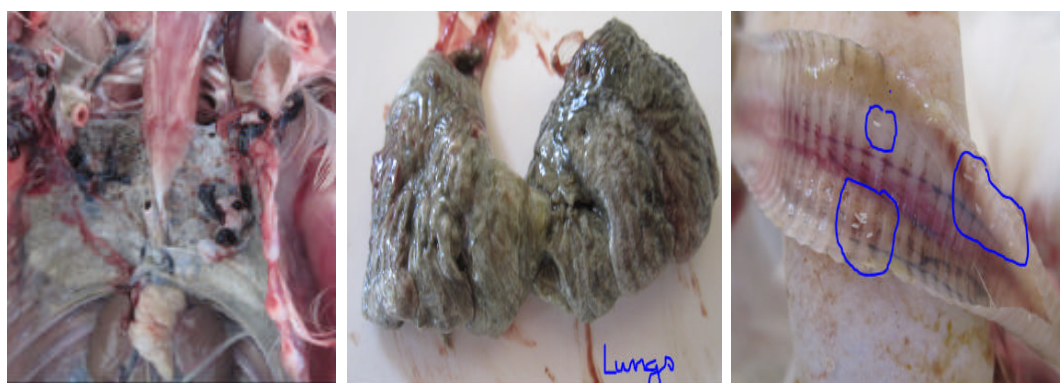
Fig. 2: Lesions in lungs (left and medium pictures) and eggs in trachea (right picture) of Syngamus trachei , a respiratory parasite tract observed in growing indigenous Senegal chickens fed the control diet