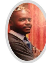
Jermane Bond Joint Centre Health Policy Institute USA