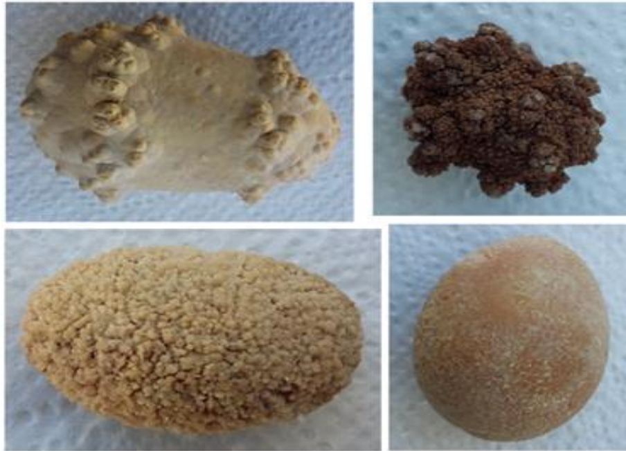
Fig-1: A few samples of the stones removed from our patients