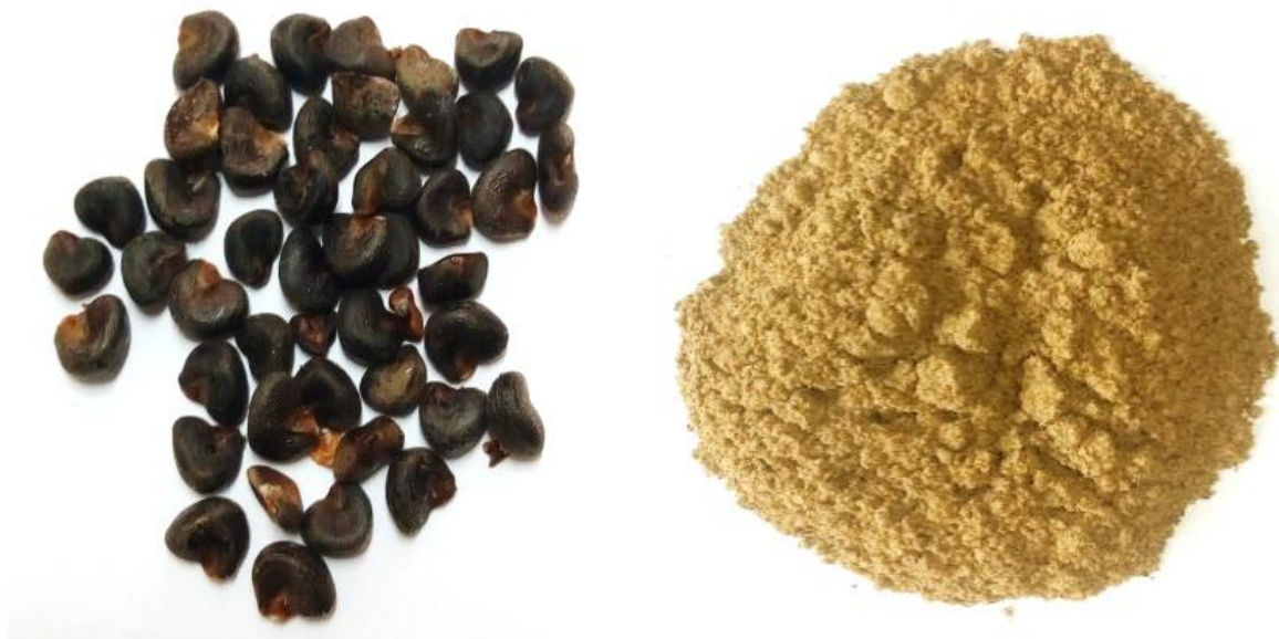
Figure 2: Seeds of H. sabdariffa sabdariffa . Figure 3: Powder of H. sabdariffa sabdariffa .

The harvest of the analyzed of the chalices was carried out at Lobogo on the Valley farm in the Mono department of Benin in December 2017. The hulls were then removed from chalices and their seeds were then separated from the hulls and dried for one month at 25°C away from sun and humidity. These dried seeds were pulverized with an electric grinder and the resulting powder was stored in sealing bottles under a hood for later use.