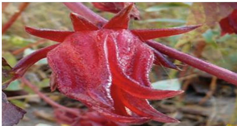
Figure 1: Chalices of H. sabdariffa sabdariffa .