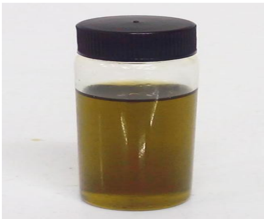
Figure 4: Vegetable oil of H. sabdariffa sabdariffa .