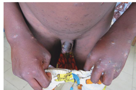
FIGURE 3: Scabiosis on the upper limbs and external genitals in a boy.

dust. [2, 20, 21]. We associate in this particular climatic context the HCLM that was noted in 8.1% of children. In this case, the skin reaction at the puncture site is thought to be related to the combination of an acute and innate reaction to the “toxicity” of the foreign protein, associated with a variable degree of skin reactivity of the patient [22].