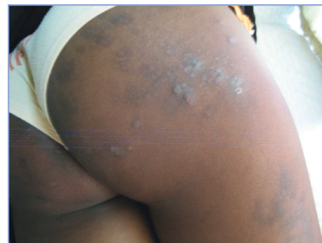
FIGURE 2: Lesions of prurigo strophulus on the lower limbs in a girl.