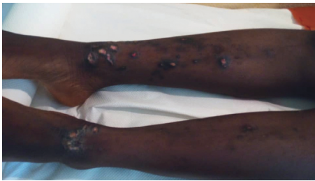
FIGURE 4: Prurigo of Besnier on the lower limbs in a girl.