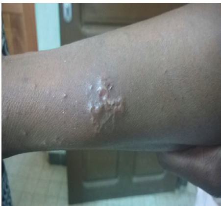
FIGURE 5: Hookworm cutaneous larva migrans on the upper limb in a boy.

Subacute prurigo is recurrent and is more rarely found in children. This has been confirmed in our series because it is found in 15% of children. It occurs preferentially in middle-aged women with atopic sites or comorbidities such as psychiatric disorders, diabetes, and renal or hepatic insufficiency [23]. This entity is often controversial by some authors, who equate it with a chronic prurigo.