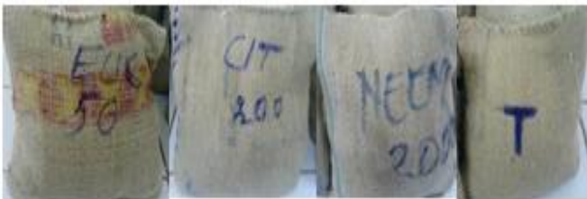
Figure 2: Cowpea conservation.