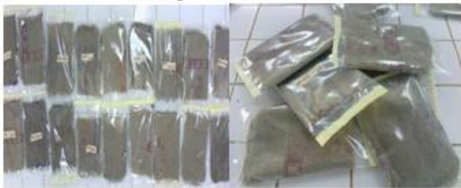
Figure 1: Jute bags impregnated with plant extracts Cowpea conservation

The made jute bags are then soaked with the plant extract, drained and allowed to dry in the shade at room temperature for 48 hours as shown in Figure 1 below.