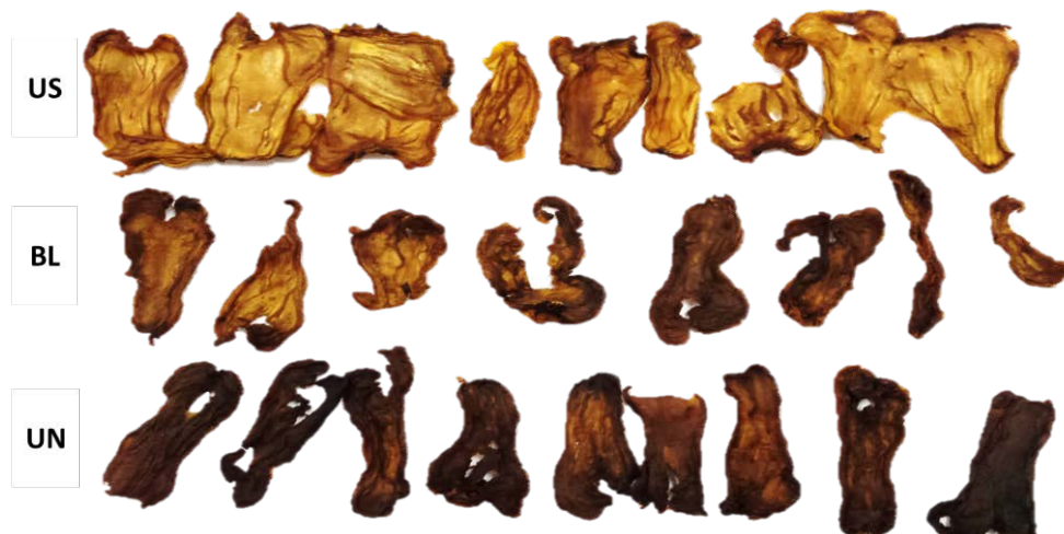
Figure 2. Color of dried cashew apple after different pretreatment conditions

Values are Mean±standard deviation (n = 3). Data in same column with different letters are significantly different (p<0.05).