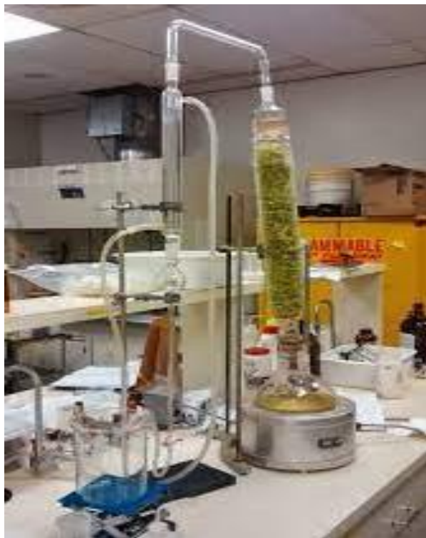
Figure 1 Essential oil extraction device, Anagonou, 2022

this tank. The water vapor-essential oil mixture is condensed in the cooler and the oil is then collected by decantation in an evaporator. The oil was collected and weighed for yield determination.