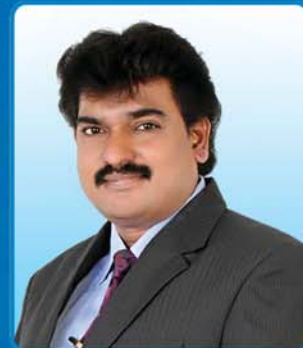
Managing Editor & Publisher