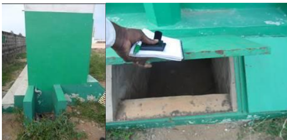
Figure 2. An Ecosan latrine in a school of Hilla-Condji, Grand-Popo, July 2013

VIP toilets are infrastructure that collect and pre-treat fecal materials, urines, and other liquid wastes. They are mostly composed of one or more pits and ventilated with the help of ventilation pipes.