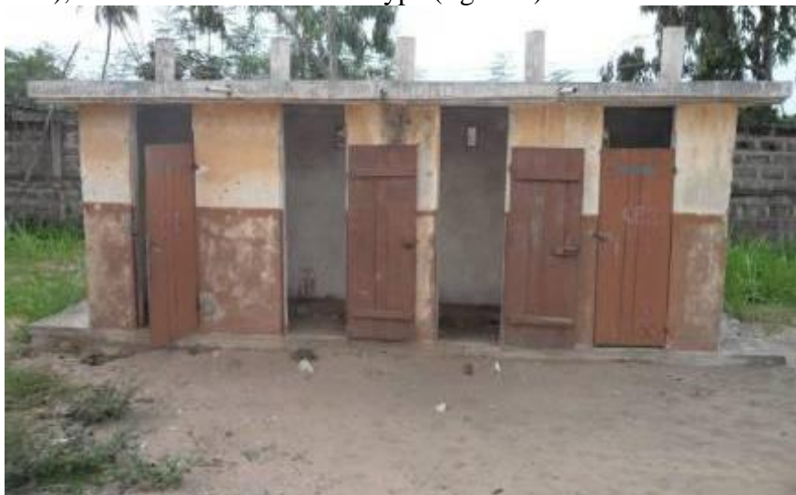
Figure 1. A VIP latrine of 4 cabins equally distributed per gender, in a school of Hilla-Condji, Grand-Popo, July 2013

The toilets of the schools studied were in general made of four (04) to ten (10) cabins. Most of them were of Ventilated Improved Pit (VIP) type (figure 1), and few were of Ecosan 1 type (figure 2).