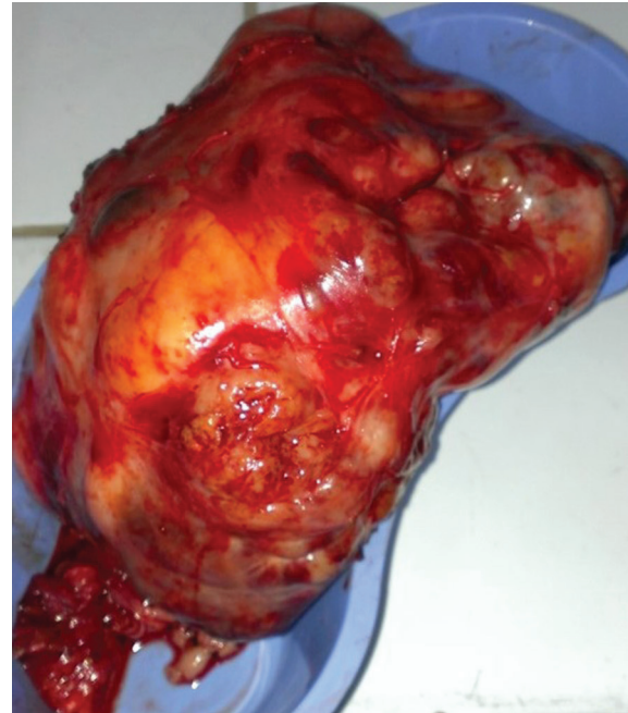
Figure 3 Solid portion of teratoma in a cup after opening and aspiration of cysts.

puncture-aspiration manipulations of cystic pouches performed intraoperatively.