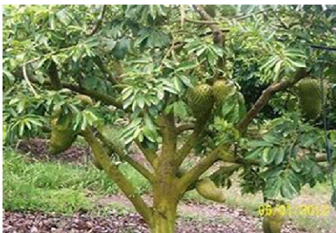
Photo 1. Annona muricata tree with fruits

Plant material: The material used in the present study is Annona muricata (Photo 1) fruits. These fruits were bought from the local markets of Ouando in the department of Ouémé, Tokpa and Ganhi in the Littoral department in Benin.