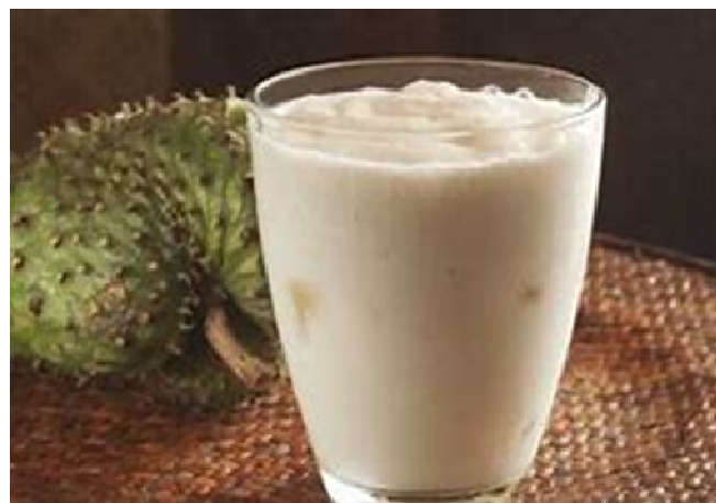
Photo 2. Puree of Annona muricata fruit

The first phase of this study involved the production of the mashed potato which was used as a raw material for juice production. This puree (Photo 2) is obtained by applying the method described in Figure 1.