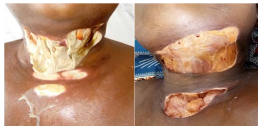
Image 1. Necrotic lesions in a case of a diffuse cervico-facial cellulitis.