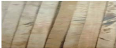
Fig. 2: Some specimens of Mimusops andongensis wood

At saturation, the following measurements were taken on each specimen: the saturated volume by the buoyancy method, the radial, tangential, axial or longitudinal dimensions using an electronic caliper of 0.01 mm precision. The specimens were then stabilized in a temperature-controlled oven at 103°C. At the end of each stabilization and at the end of the drying process, the anhydrous mass, also called dry mass, was measured using a 0.01 g precision electronic balance. Also, the dimensions in the orthotopic directions of each sample were measured.