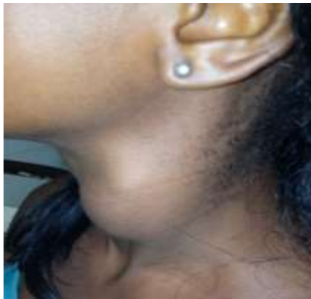
Fig-1: Physical aspect of the left lateral cerebral swelling (profile view photo)

improvement with cervical lymph nodes disappearing but persistent carotid aneurysm.