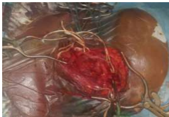
Fig-3: Intraoperative view of the surgical cure