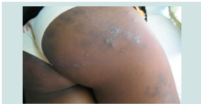
Figure 1: Prurigo in an HIV-infected girl.

Cotrimoxazole antibiotic prophylaxis was only effective in 9.5% of these children. This may be related to the more limited indications of antibiotic prophylaxis in children. Still it did not seem to influence the occurrence of dermatoses ( p = 0.22 ).