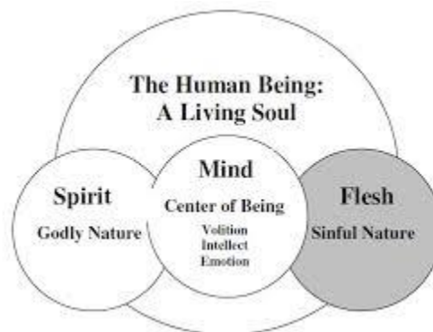
Graphic 1: google scholar

The NAS Old Testament Hebrew Lexicon says that the human being is a Nephesh , i.e. a living soul: