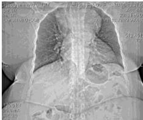
Fig-1: Radiological appearance showing anterior mediastinal widening

The immediate operative sequences are simple and the patient was put in exead on the fifth postoperative day. The pathological anatomy examination concluded with an adenomatous colloid goitre, multi nodular remodeled by cysts and fibrosis.