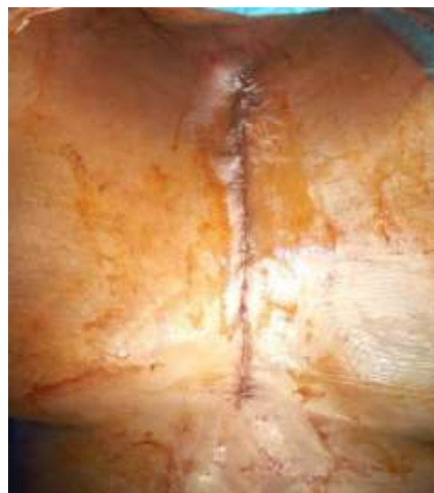
Fig-7: Peroperative view showing skin closure at the end of the procedure