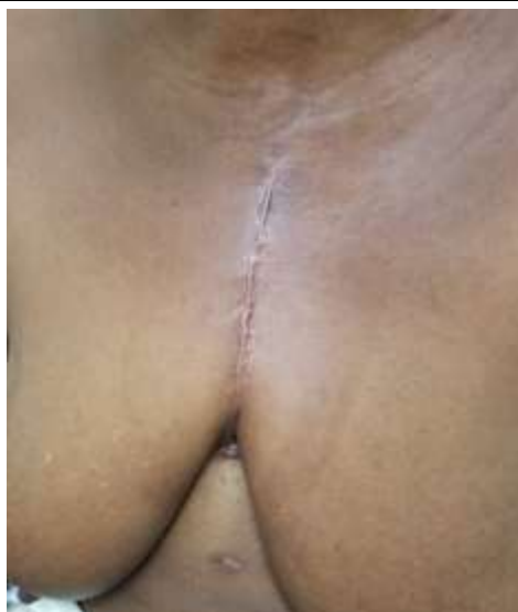
Fig-8: Postoperative scar