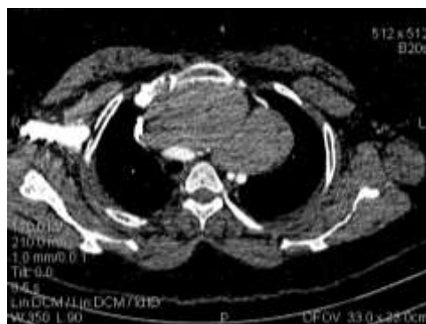
Fig-2: CT appearance showing an endothoracic mass with tracheal deviation