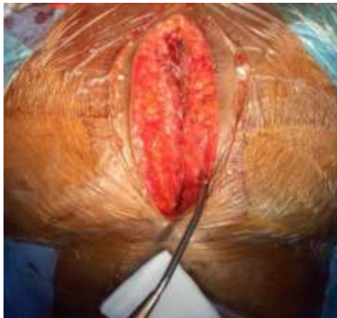
Fig-6: Perioperative view showing the sternal closure with steel wire