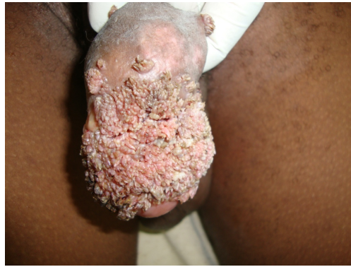
Figure 3. Giant condyloma of the glans in a 40-year-old HIV-positive man, received at the dermatology-venereology clinic of Cotonou in January 2013.