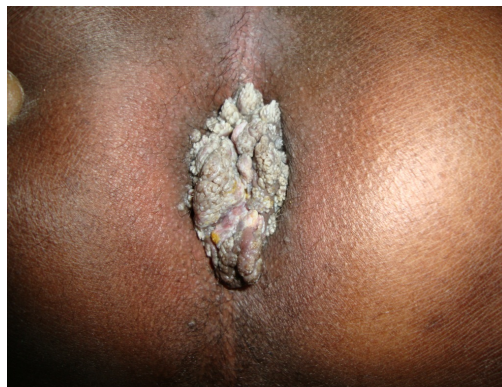
Figure 4. Anal giant condyloma in a heterosexual HIV-positive man, aged 45, received at the dermatology-venereology clinic of Cotonou in February 20.

A combination of two or three STIs was observed in 30 patients (40.5%). There were two cases (2.70%) of genital herpes, one case (1.35%) of syphilis, one case (1.35%) of chlamydia, two cases (2.70%) of scabies and 13 cases (17.56%) of genital candidiasis. HIV serology was positive in 12 patients or 16.2% of cases.