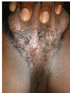
Figure 1. Acuminate condyloma of inguinal folds and scrotum in a 30-year-old man received at the dermatology-venereology clinic of Cotonou in July 2014.

The lesions were in the external genital organs (glans, penis, urethra, vulva) in 70% of the cases followed by inguinal folds and scrotum (8%) and anus and anal margin (3%). In 19% of the cases, the lesions had a multiple localization. According to the clinical form, 61 cases (or 82.4%) of acuminate condyloma ( Figure 1 ), 8 cases (or 10.8%) of papular condylomas ( Figure 2 ) and 5 cases (or 6.8%) of giant condylomas ( Figure 3 and Figure 4 ).