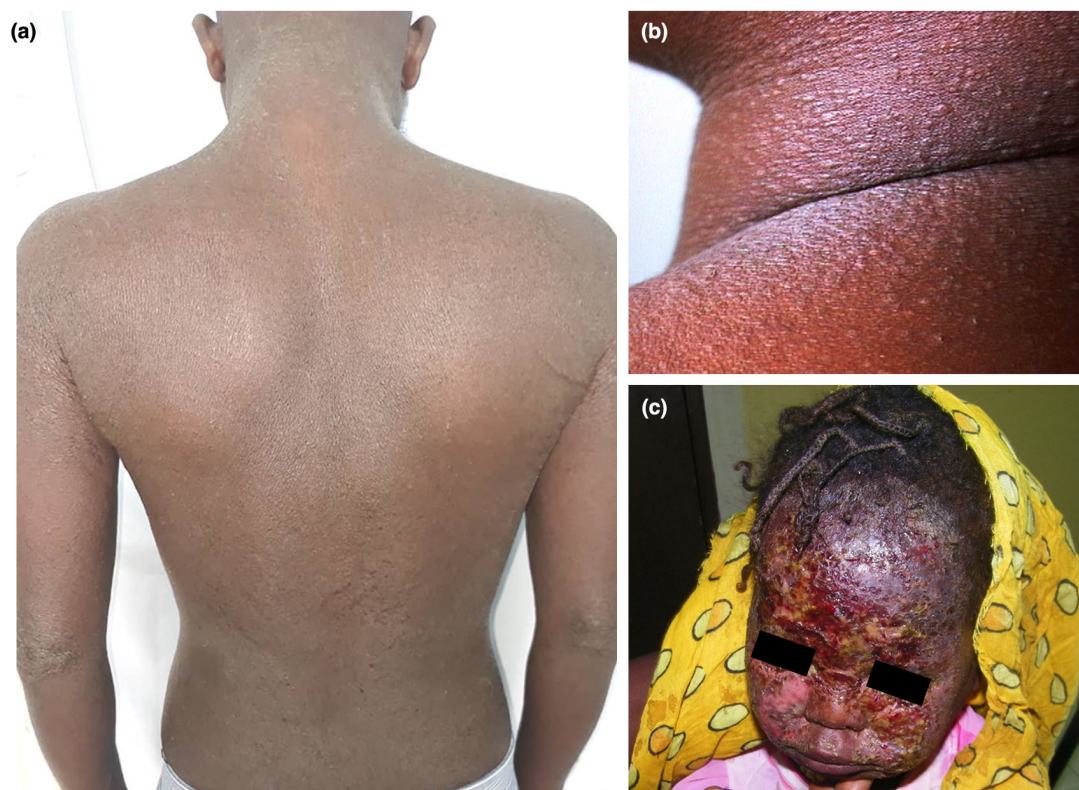
Figure 3 (a) erythroderma after herbal therapy, (b) papular AD and (c) severe bacterial superinfection in childhood AD.

The major differential diagnoses cited by participants besides contact eczema are scabies, insect bites, actinic lichen planus,