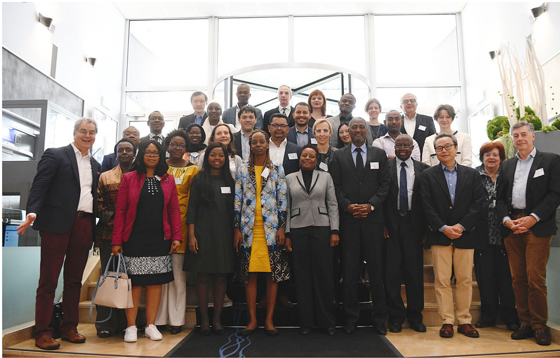
Figure 1 Group photo, Novotel Genève Centre.

'eczemas' in the WHO non-NTD chronic conditions list, which probably includes many cases of contact allergy and other eczematous conditions, remains a problem, compounded by the lack of validated diagnostic criteria for AD adapted to black African skin and environments. In addition to difficulties with diagnosis, barriers to the implementation of therapeutic education include, as for NTDs, poverty, inadequate facilities, shortage of skilled health workers, illiteracy, language and cultural barriers. The possibility of following an 'integrated' approach, as for NTDs, by better education of primary healthcare workers, including using digital technologies, may improve appropriate primary patient care and patient referral to specialists when necessary. 7