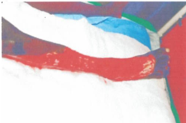
Figure 4 Figure 4