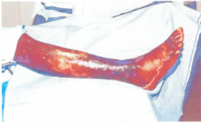
Figure 2 Figure 2