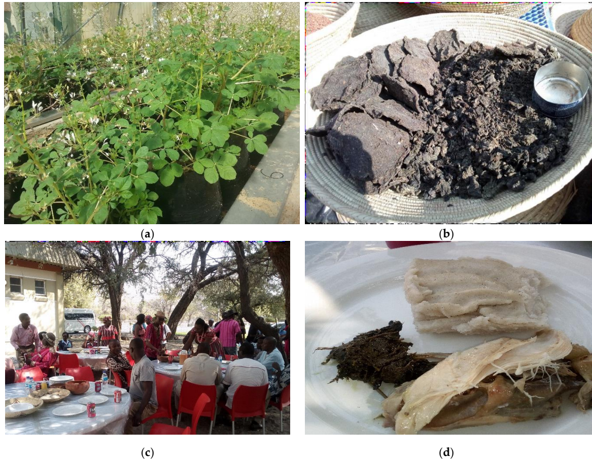
Figure 1. (a) Spider plant growing in the screen house; (b) processed spider plants sold in the open markets in northern Namibia; (c) a cultural festival at Ogongo campus of the University of Namibia where spider plants were used to serve the invited traditional leaders and delegates as a sign of honor in 2019; (d) typical dish of the Ovambo ethnic group which comprises cooked spider plant (dark portion).

a pure concoction or mixture with other herbs. It was also reported that spider plants were used as animal food, particularly amongst the Kwambis. The use of spider plants as a non-vertebrate poison (pesticide) was the least amongst the survey participants.