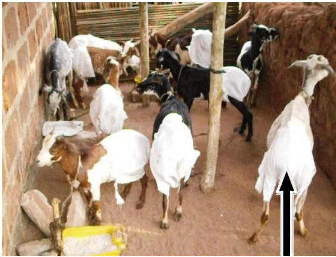
Figure 1. Morning faeces recovery device ↑ (diaper) from animals.

plants are being checked. This study aims at evaluating the efficacy of an aqueous extract of the leaves of Chenopodium ambrosioides against strongyle infection in West African Long Legged (WALL) goats. The plant is common in many parts of the world like Europe, Asia and Africa. It is used as medicinal herb (Quinlan et al., 2002; Ruffa et al., 2002; Efferth et al., 2002; MacDonald et al., 2004; Patrício et al., 2008). It is well known in rural areas of Benin as “trouzouman” (in “fongbé”, a national language) where it is deemed effective against some human parasitic diseases such as pinworms, tapeworms, roundworms and hookworms.