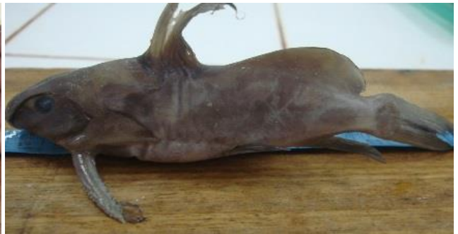
j) Synodontis melanopterus (Boulenger, 1903)