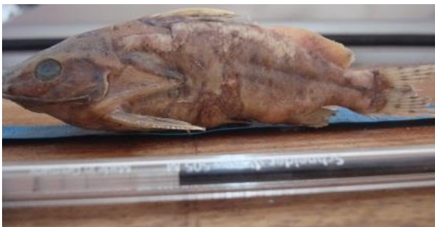
k) Synodontis nigrita b (Valenciennes, 1840)