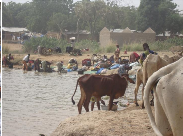
Fig 3: Multiple utilizations of the river, (1) men and women are washing their clothes and doing dishes and (2) animals (oxen) are drinking water.