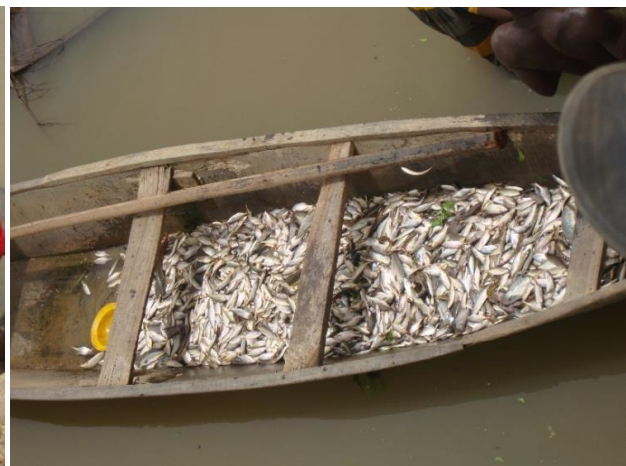
Fig 4: Fisherman catches comprising small fish individuals that indicate overfishing.