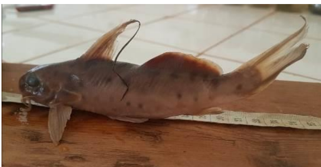
m) Synodontis filamentosus (Boulenger, 1901)