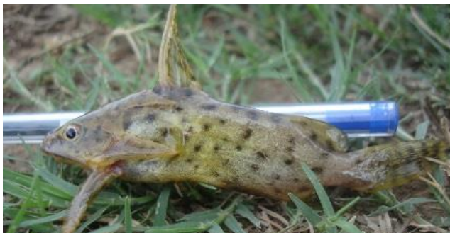
c) Synodontis nigrita a Valenciennes, 1840