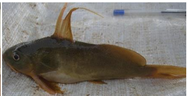
n) Synodontis frontosus (Vaillant, 1895)