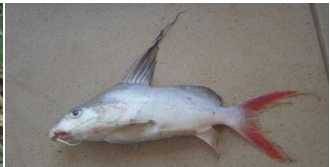
d) Synodontis clarias (Linnaeus, 1758)