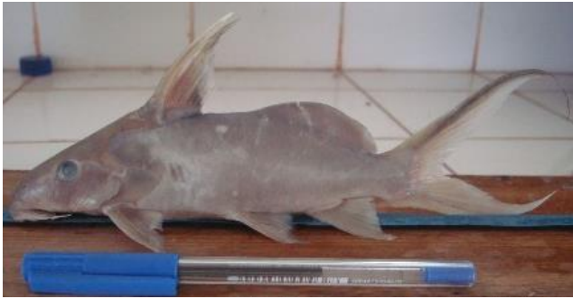
e) Synodontis sorex (Günther, 1864)