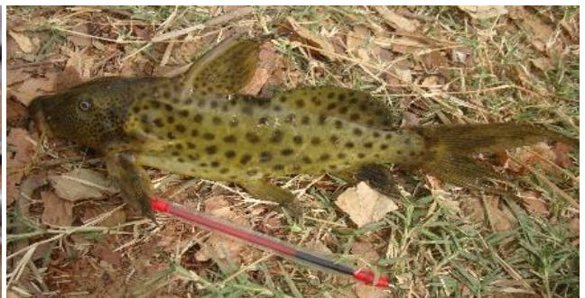
l) Synodontis courteti (Pellegrin, 1906)