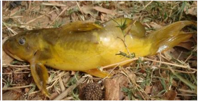
f) Synodontis violaceus (Pellegrin, 1919)