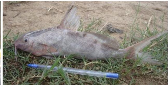
b) Synodontis membranaceus (Boulenger, 1907)