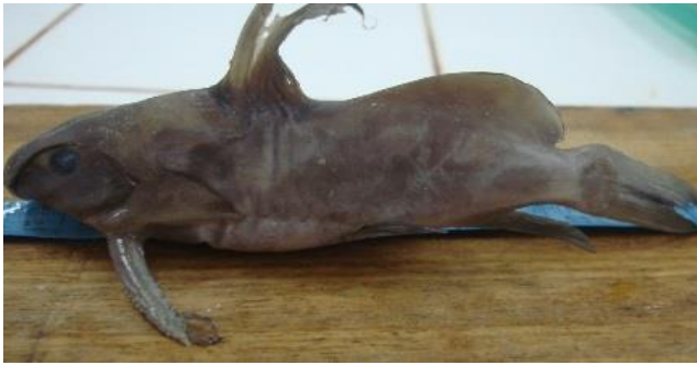
g) Synodontis melanopterus (Boulenger, 1903)