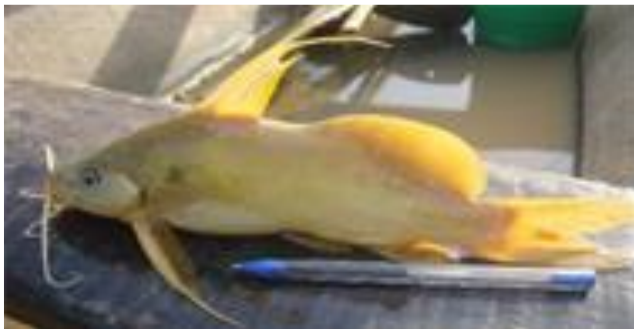
a) Synodontis schall (Bloch & Schneider, 1801)

Synodontis nigrita b: Synodontis nigrita with non-apparent spots.