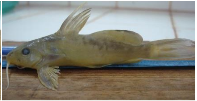
h) Synodontis macrophthalmus (Poll, 1971)