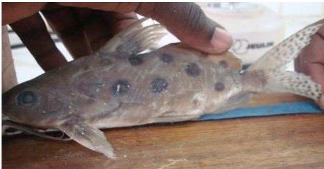
i) Synodontis ocellifer (Boulenger, 1900)