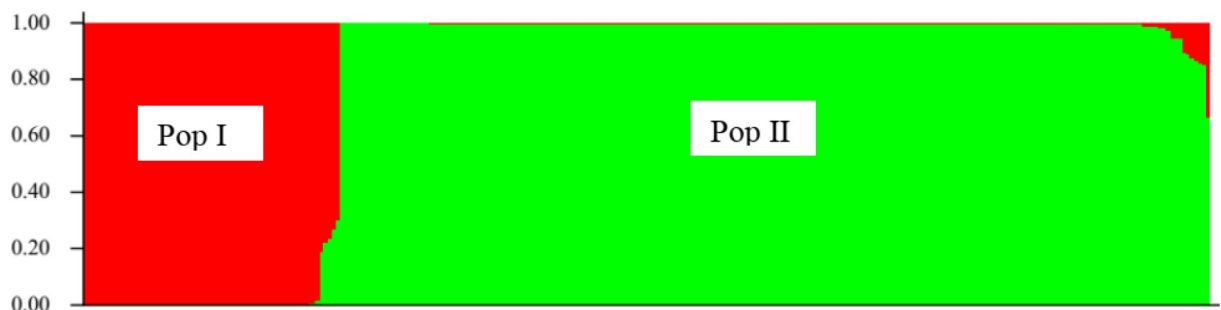
Fig 3. Barplot of populations sorted by Kinship matrix (Pop I = population I, Pop II = population II).

Based on the 113 SNP markers included in the GWAS analysis, the corrected Bonferroni threshold for significant marker-trait associations was p -value = 4.42 \times 10^{-4} . Significant SNP-