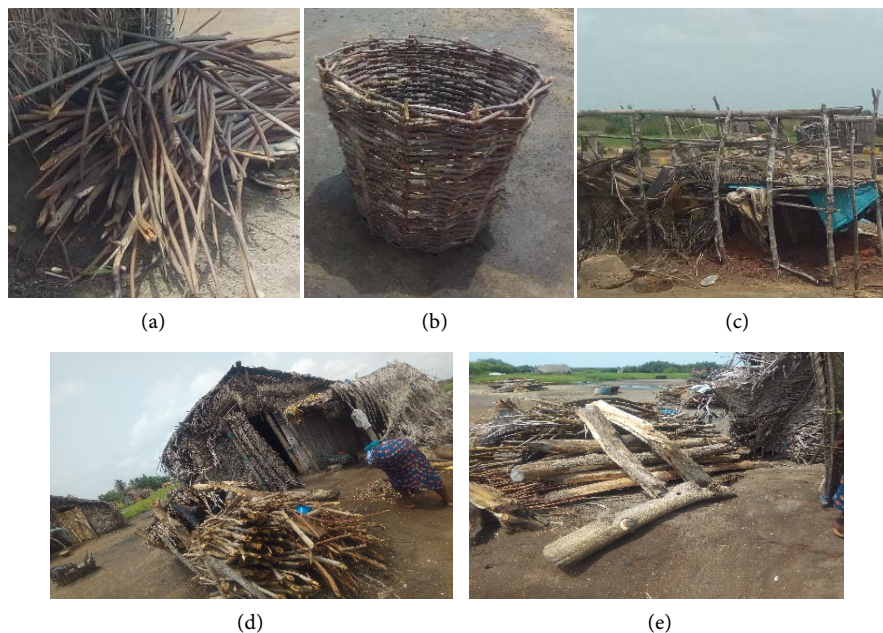
Figure 5. Mangrove wood (a) used to make leaching baskets (b), to build shelters ((c), (d)), to make fire for brine evaporation (e).