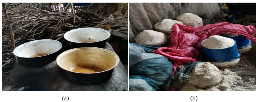
Figure 4. Photographs of salt fire-crystallized utensils (a) and a bundle of crystallized salt, ready to be sold (b). These photographs portray the poor hygienic conditions of traditional table salt harvesting in Republic of Benin.

The table salt production technic that massively contributes to the mangrove destruction in the coastal zone of Benin Republic is the one using fire wood as source of energy to evaporate the brine. From Table 1 , 82.20% of table salt producers employ wood from the cutting down of mangrove for several purposes. The leaching baskets used to obtain the brine are made out of mangrove ( Figure 3(a) for empty baskets, and Figure 3(b) for loaded basket). Figure 5 depicts the type of mangrove used to make leaching baskets Figure 5(a) , the basket Figure 5(b) . Mangrove wood is also used to construct the shelters ( Figure 5(c) , Figure 5(d) ) and to evaporate brine ( Figure 5(e) ). A substantial reduction in mangrove