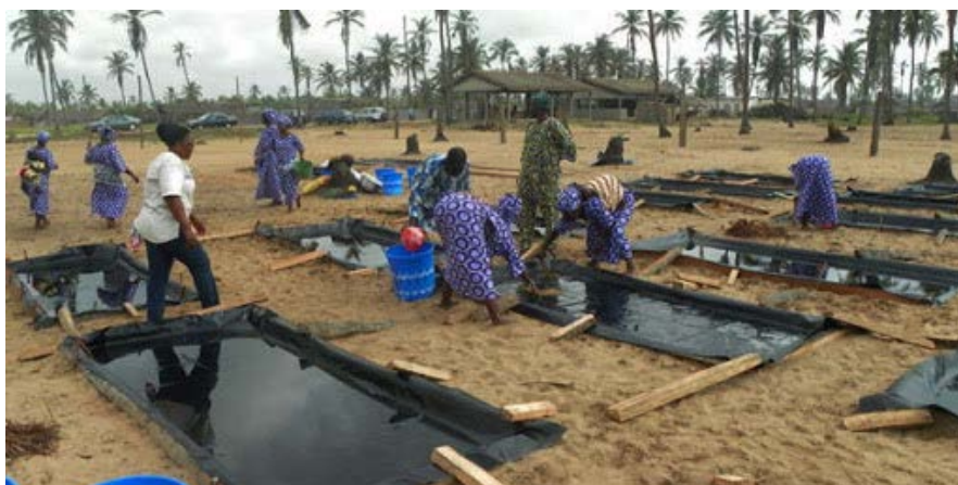
Figure 2. Photograph of women Association of Sèmè-Okoun installing the salt production plant which's fundamental component is the black tarpaulin held by woodbin.