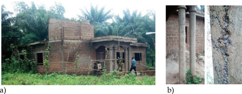
Figure 1. An example of a one-storeyed house in Misséréte, constructed in 2014 with the use of OPKS concrete for the supporting elements. (a) Overview of the ongoing building. (b) Zoom on the columns of the main facade, showing on their surface the oil palm kernel shells in the cement matrix.

In the present study, a trial mix is proposed for a structural lightweight concrete using OPKSs of Benin as coarse aggregate, based on the principle of absolute volume methodology of ACI 213.