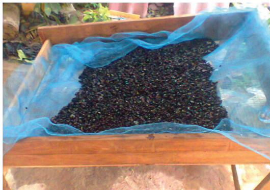
Figure 5. Draining of OPKSC after imbibition to obtain saturated surface dry (SSD) status.