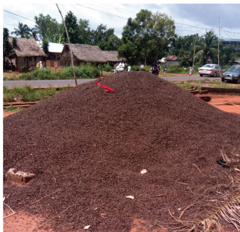
Figure 2. OPKS waiting for a transaction at Missérété.