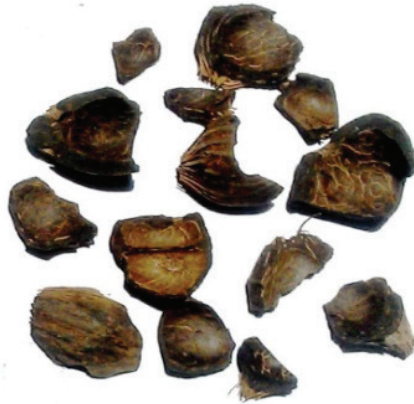
Figure 3. Different size of Oil Palm Kernel Shell for the concrete mixing.