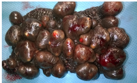
Figure 3: Resected specimen.

The closure of the scrotum is carried out using an overedge stitches of 2/0 vicryl with no scrotal drainage. Histopathological examination of the surgical specimen revealed under scrotal acanthosis the presence of intradermal calcium dystrophic lesions of varying sizes lined with epithelial and connective tissues (Figure 4).