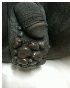
Figure 1: Scrotal nodules.

Mr. D. C. aged 57 years old was admitted to intense care unit for complete urine retention. The oral questioning revealed an initial flare of small multiple pruritic scrotal swellings which gradually increased in sizes. When pressurized, they spurt out a whitish fluid crystallizing in few seconds. Physical examination carried out after urinary drainage revealed the presence of multiple whitish scrotal nodules of about 1 cm in diameter, hard, painless and movable in relation with muscle fascia (Figure 1).