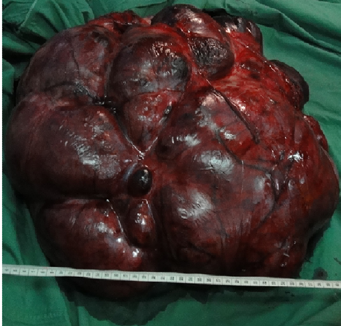
Figure 5: poly-lobed giant ovarian cyst