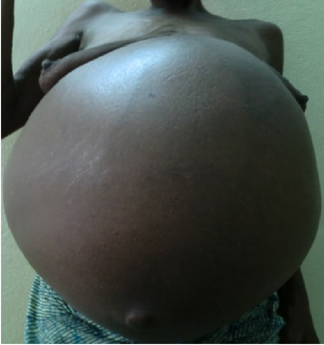
Figure 1: Large abdominal mass with collateral circulation and unfolded umbilicus