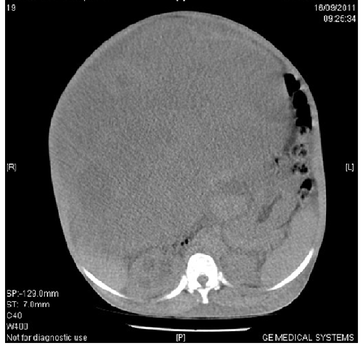
Figure 2: CT Image of the giant ovarian cyst of the right ovary