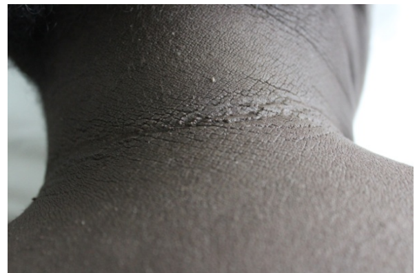
Figure 1: Warty papillomatous lesions of brownish color and velvety appearance on the neck in a young woman with HAIR-AN syndrome.

A 20-years-old girl with a history of spaniomenorrhœa and menorrhagia was consulted for black spots with a granite surface that have been expanding since the age of 10 and are mistaken for a side phenomenon of lack of hygiene. There were macular, hyperpigmented, papillomatous surfaces and placards, poorly defined. These lesions were on the neck (Figure 1) with overflows on the mandibular areas and the ears, in the vertebral groove, the armpits (Figure 2), and the umbilicus.