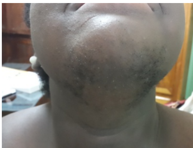
Figure 3: Increased hairiness of the chin definite hisurtism in a young woman with HAIR-AN syndrome.

The mucous membranes were unaffected. The other aspects of the checkup revealed a clinical syndrome of hyperandrogenism that included hirsutism, retentional acne and android obesity with a body mass index of 32.8 kg/m 2 . Hirsutism was defined by increased hairiness of the chin (Figure 3) and limbs, losangic pilosity of the abdomen. The blood sample showed hyperglycemia at 1.3 g/dL (normal value: 0.72-1.18 g/dL), hyperprogesteronemia at 0.63 ng/mL (normal value: 0.25-0.54 ng/mL), hypertestosteronemia at 0.87 ng/mL (normal value: 0.2-0.5 ng/mL) and hypercholesterolemia at 2.63 g/L (normal value: 1.25-2.25 g/L) while Follicle Stimulating Hormone (FSH), Luteinizing Hormone (LH), prolactin and 17-hydroxyprogesterone were normal. Normal cortisoluria and blood ionogram made it possible to reject Cushing's syndrome. In the presence of hormonal disturbances, ultrasound of the uterus was requested and showed polycystic ovaries. The diagnosis of HAIR-AN syndrome was concluded. The patient was treated with tretinoin 0.05. After advice from the endocrinologist, she was received metformin (1000 mg/day) associated with dietary solutions. The electrocardiogram was normal. Psychological follow-up was requested.