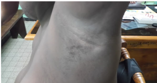
Figure 2: Warty papillomatous lesions of brownish color and velvety appearance in the armpit in a young woman with HAIR-AN syndrome.

The mucous membranes were unaffected. The other aspects of the checkup revealed a clinical syndrome of hyperandrogenism that included hirsutism, retentional acne and android obesity with a body mass index of 32.8 kg/m 2 . Hirsutism was defined by increased hairiness of the chin (Figure 3) and limbs, losangic pilosity of the abdomen. The blood sample showed hyperglycemia at 1.3 g/dL (normal value: 0.72-1.18 g/dL), hyperprogesteronemia at 0.63 ng/mL (normal value: 0.25-0.54 ng/mL), hypertestosteronemia at 0.87 ng/mL (normal value: 0.2-0.5 ng/mL) and hypercholesterolemia at 2.63 g/L (normal value: 1.25-2.25 g/L) while Follicle Stimulating Hormone (FSH), Luteinizing Hormone (LH), prolactin and 17-hydroxyprogesterone were normal. Normal cortisoluria and blood ionogram made it possible to reject Cushing's syndrome. In the presence of hormonal disturbances, ultrasound of the uterus was requested and showed polycystic ovaries. The diagnosis of HAIR-AN syndrome was concluded. The patient was treated with tretinoin 0.05. After advice from the endocrinologist, she was received metformin (1000 mg/day) associated with dietary solutions. The electrocardiogram was normal. Psychological follow-up was requested.