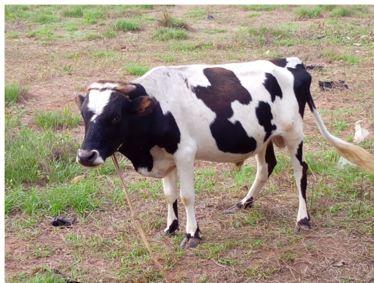
Figure 1. Lagune cattle bull.

The Lagune cattle (Figure 1) is a West African dwarf shorthorn cattle type described as a small-bodied animal, blocky in conformation with short and fine-boned limbs [15,21,28–30]. It has a compact body, no hump, a straight back, and a broad head. The face is slightly dished, and the horns are very short. The dominant coat colour is generally black, white, pie black, black pie [21,28–30]. Some linear traits have been measured in the Lagune cattle by several authors. Reported average height at withers varies from 80 to 100 cm for adult females and is about 105 cm for adult males [15,21]. It varies from 80.6 to 96.2 cm according to Domingo [20] and was estimated at 82.2 \pm 2.4 cm by Traoré et al. [31]. The heart girth averages 110.5 \pm 4 cm [31] and ranges from 102.8 to 136.3 cm according to Domingo [20]. The scapula-ischial length varies from 92.3 to 119.7 cm for 1.2 to 5 years old animals, respectively [20]. The body length (from lateral tuberosity of the humerus to tuber ischii) averages 98.9 \pm 3.4 cm [31].