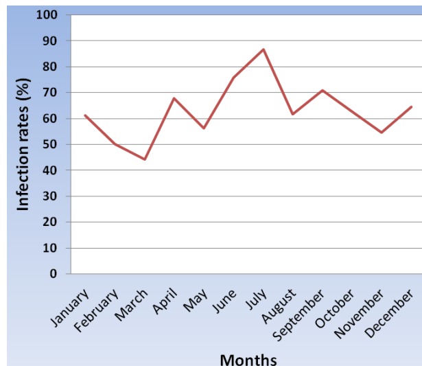
Figure 1. Nodular oesophagostomosis prevalence.

Parasitic nodules due to Oesophagostomum spp. were found on the terminal portion of the abomasum, on the small intestine and on the large intestine. The mucosa of the large intestine was the most dominant location of nodules (Figure 2). Respectively, 17.8, 25.7, and 56.4% of infected viscera had generalized, fairly extensive and localized lesions.